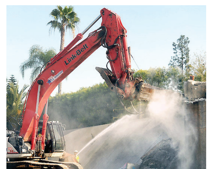
Crews demolish the existing abutments at the Colorado Boulevard bridge in Arcadia.